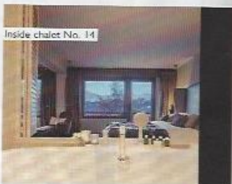
Inside chalet No. 14